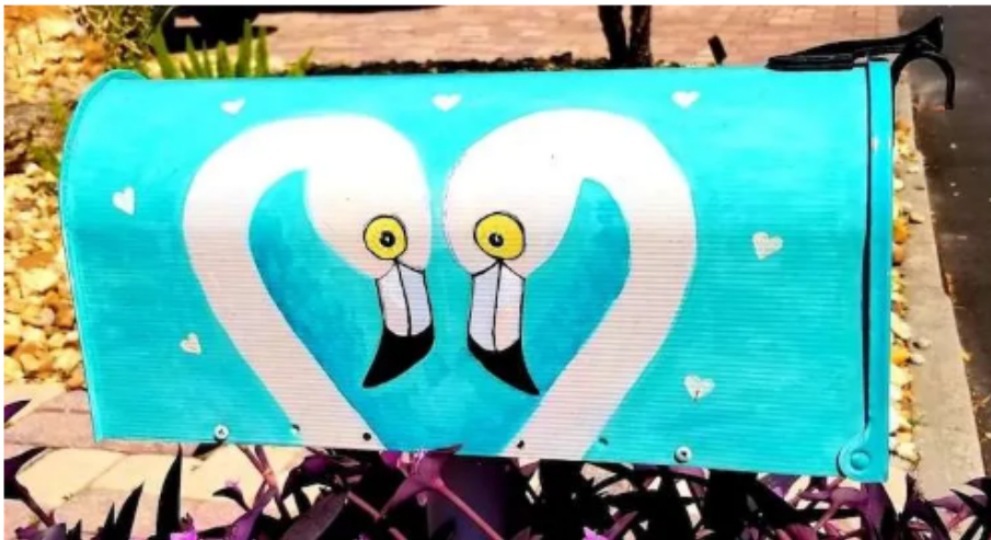
The August 15 letters to the editor of The Gabber Newspaper.