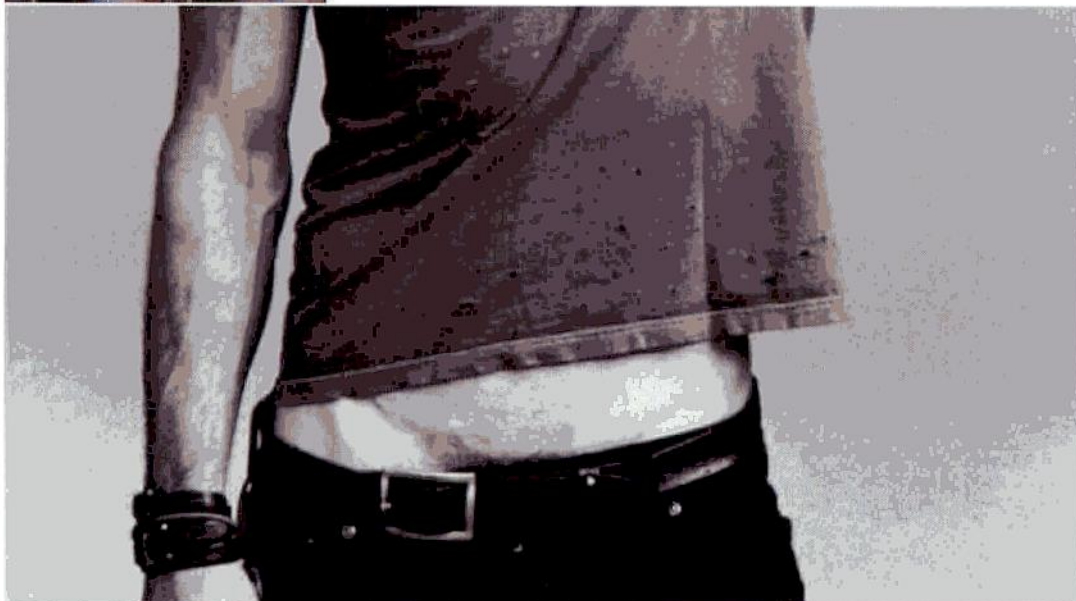
Justin Theroux's Pubes, 2/13/2012