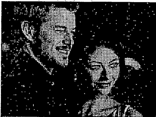
Eric Dane and Rebecca Gayheart

NEW YORK (CBS) The legal battle between Gawker and actors Eric Dane and Rebecca Gayheart has been settled after the website agreed to take down the couple's homemade sex tape in return for them not suing the bejeezuz out of the gossip blog.