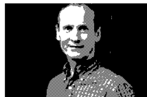
Motley Fool Issues Rare "Double Down" Stock Alert