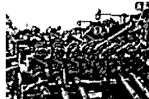
A Thoughtful View on Fracking