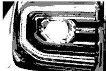
The Results Are in: Here Are the 12 Cars With the Best Resale Value in...