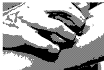
Psoriatic Arthritis Symptoms: What You Should Know