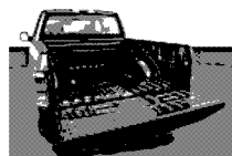
10 New Cars We Are Super Excited About