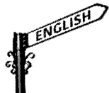
Grammar Quiz: Can You Pass It?