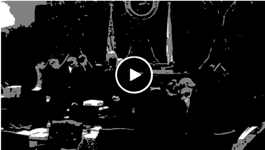
Hulk Hogan v Gawker Trial Day 9 Part 1