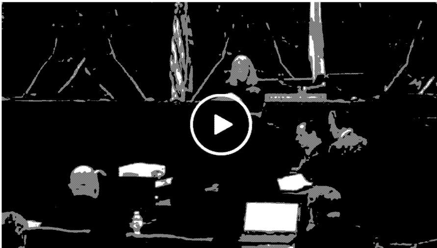
Hulk Hogan v Gawker Trial Day 8 Part 3