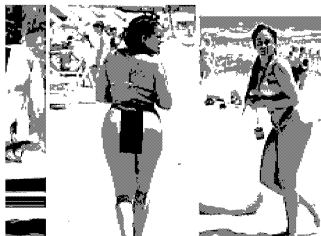
Natalie Nunn Unleashes Her Booty