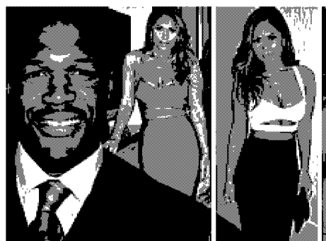
Michael Strahan Sacks a New Girl?