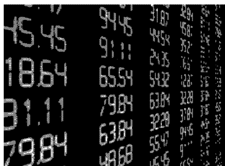
Software Is Eating Personal Investing