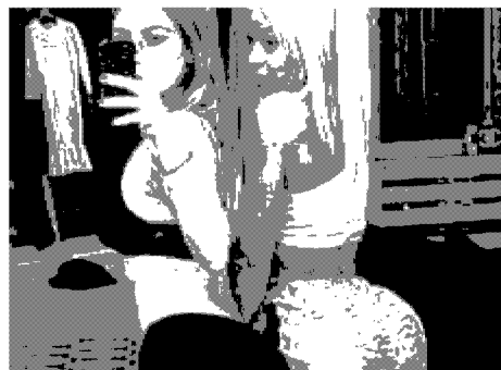
Selfies Gone Wrong: 17 Most Embarrassing Celeb Selfies