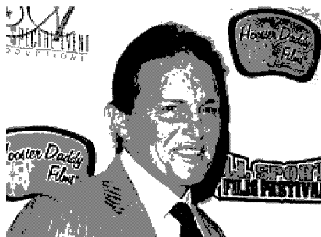
The Family Finally Weighs In on Bruce Jenner's News