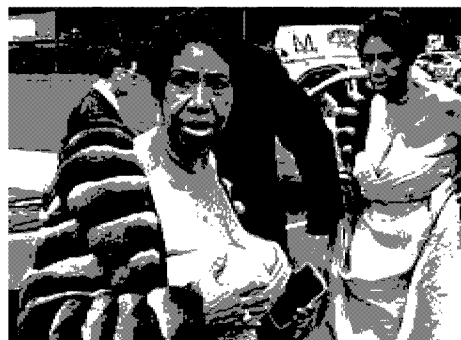
Aretha Franklin's Boobs Make a Break For It!