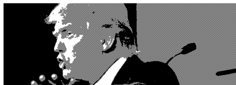
Donald Trump: “I Do Not Want To Embarrass People”