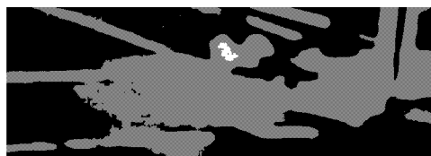
Surveillance Video Shows Shooter Firing Rifle On Philadelphia Streets

Here’s a transcript of today’s proceedings: