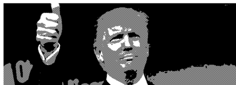
Breitbart Staffers Believe Trump Has Given Money To Site For Favorable Coverage