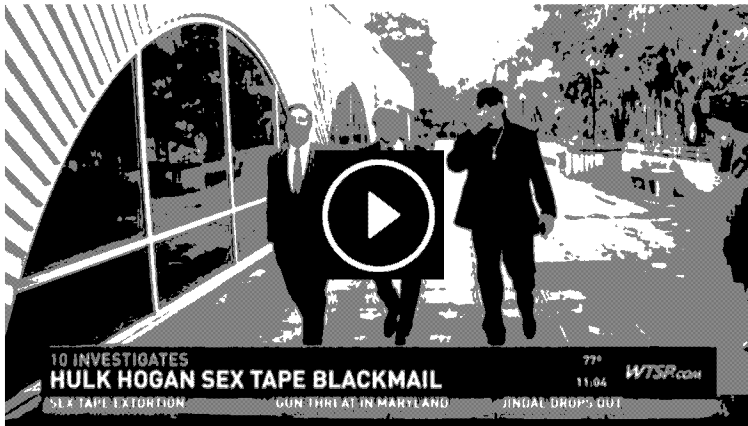
Hulk Hogan sex tape blackmail

Most know him as Hulk Hogan. His real name is Terry Bollea. He hasn't said much since his lawsuit against the web site Gawker, but this Tampa Police report speaks volumes.