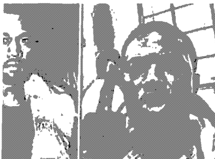
Kanye Finally Fires Back at Ray J!