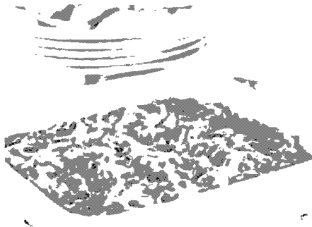
Chicken Tortilla Bake RO*TEL