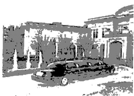
Rick Ross Now Owns The Largest Pool In the U.S.