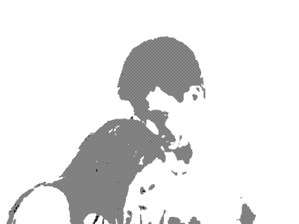
Does Size Really Matter? Lifescript