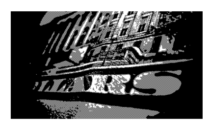
Five Ideas For the Next Century of Taxes