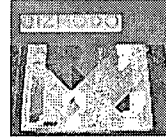
These Tiny Electronic Blocks Can Make Huge, Moving Works of Art

About Help Jobs Legal Privacy Permissions Advertising Subscribe Send a tip