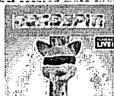
Sophie The Giraffe Must Die