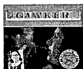
Here Is the Crazy 1990s TV Ad Molly Shannon Did for the NRA