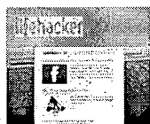
How Facebook Uses Your Data to Target Ads, Even Offline