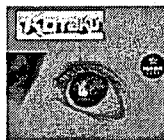
Here's Why Mass Effect's Villains Were So Excellent