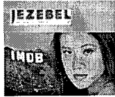
No Business for Old Women: Actress Sues IMDb for Revealing Her Real Age