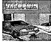
The Ten Best Car Jokes