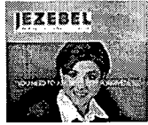
Terrifying Public High School Speaker: If You Take Birth Control, Your Mother Probably Hates You