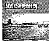
The Ten Most Badass Military Vehicles You Can Drive On The Road