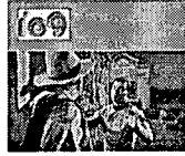
The Real Reason Why Science Fiction Westerns Are Such a Hard Sell