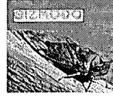
Cicada Nation: All About Those Noisy Little Bastard Bugs

About Help Jobs Legal Privacy Permissions Advertising Subscribe Send a tip