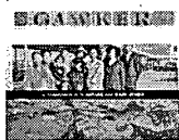
The Only Thing That Remains