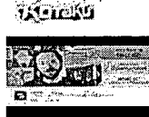
Is the Decision to Buy Call of Duty or Battlefield a Moral Choice?