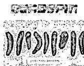
The Greatest Shots On Augusta's Back Nine In Masters History