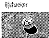
Top 10 Instant Stress Busters