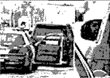
Kylie Jenner Ticketed for Driving While Black